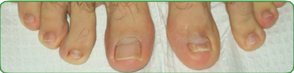
Photo was taken 4 months after the first treatment.