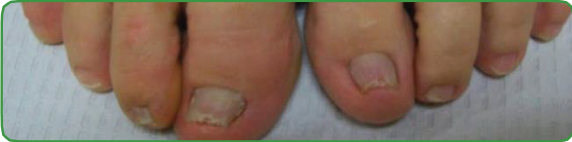
Photo was taken 7 months after the first treatment.